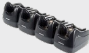
• 94A150037 4-Slot Charging Dock • 94A150038 4-Slot Ethernet Dock